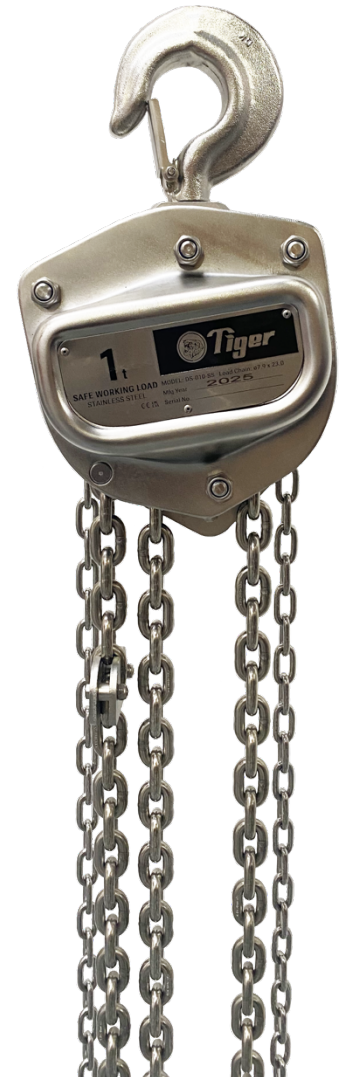
Chain block & trolley which is used in the UK pharmaceutical industry