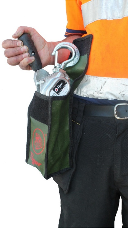
500kg lever hoist with belt bag