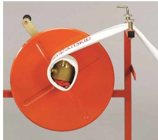
General type FH-02