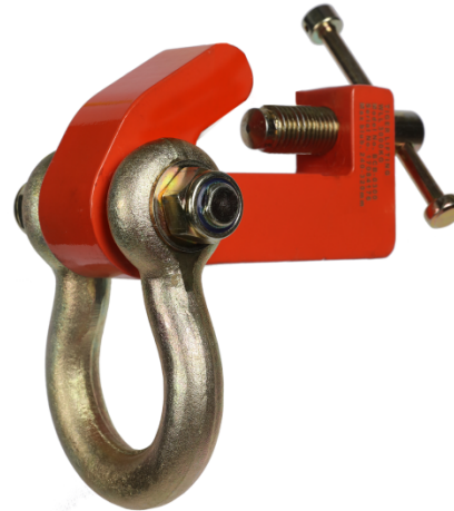
3t unit (BCB-0300)