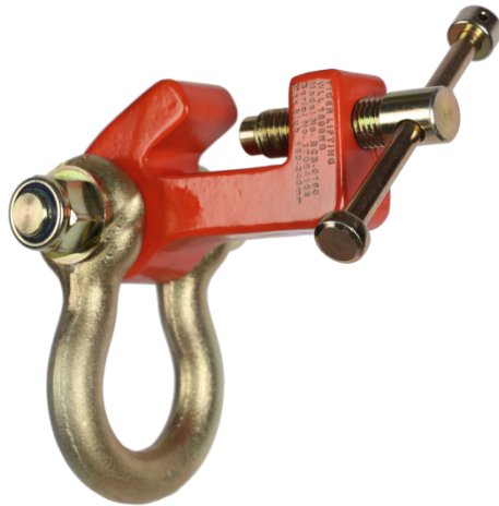
1.5t unit (BCB-0150)