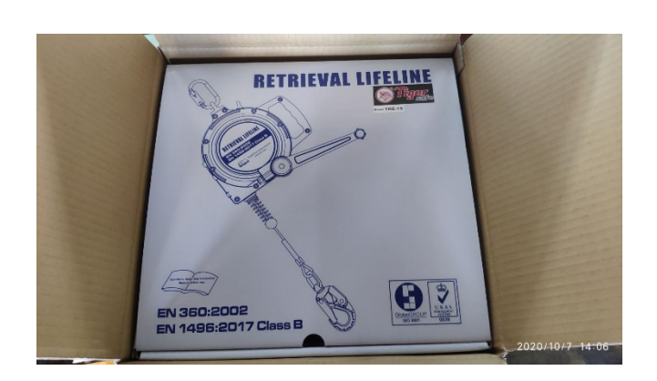
Double boxed packaging

Due to our policy of continual product development, dimensions, weights and specifications may change without prior notice. Please check with your Tiger sales team when ordering.