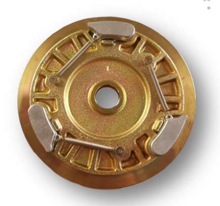
Triple pawl brake system